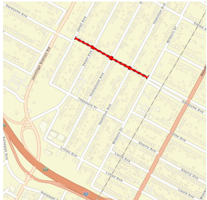
Figure 1-2, Project Limits